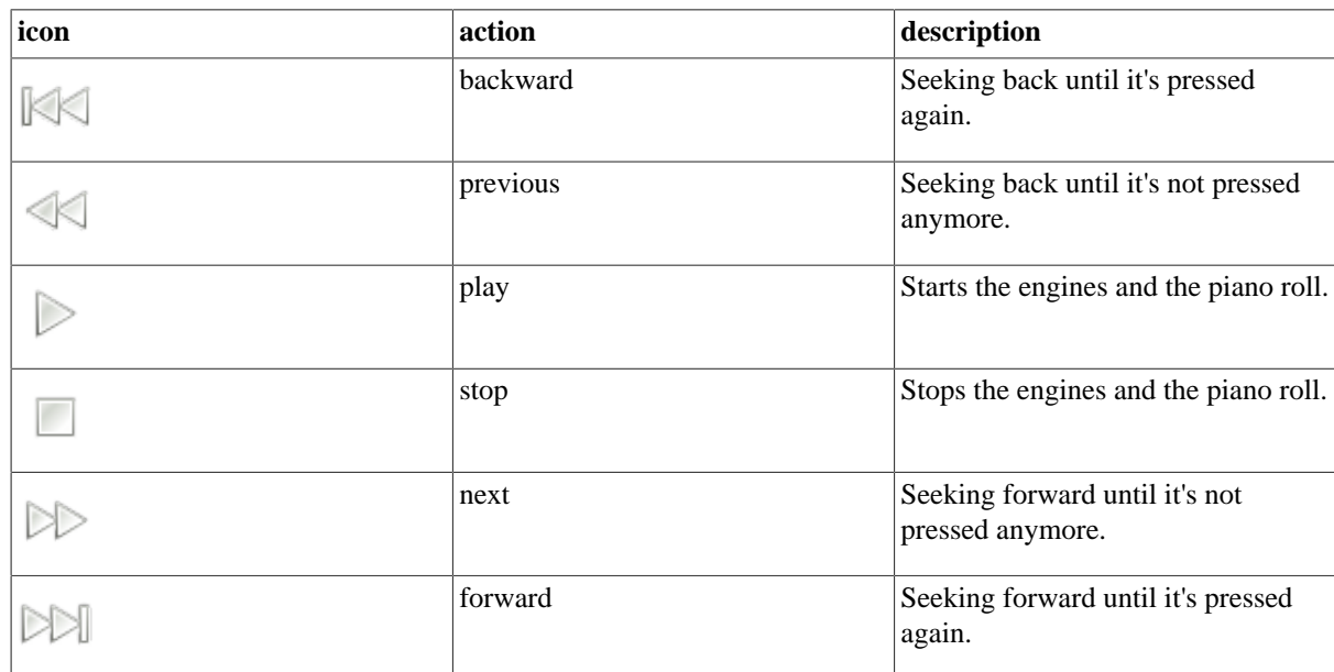
Table 4.1. AGS playback controls table

The loop checkbox enables the loop L and loop R settings below. It causes the notation to loop playback. Auto-Scroll checkbox animates the horizontal scrollbars to follow playback position. Use exclude sequencers checkbox to enable/disable pattern based sequencers.