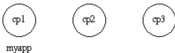
Figure 9.1: Application myapp - Situation 1

When all nodes are operational, myapp can be started. This is achieved by calling application:start(myapp) at all three nodes. It is then started at cp1 , as shown in the following figure: